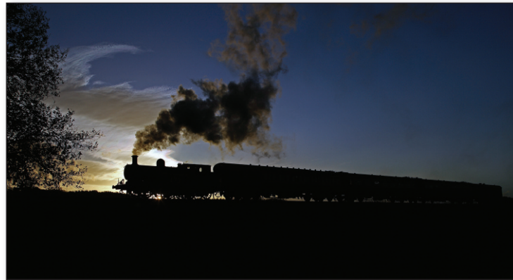
Right: Heading southbound towards Sheffield Park the E4 locomotive is silhouetted against the sky.