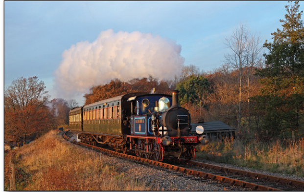
Seen heading south at Monteswood Lane is P class 323 with the late evening sun illuminating the train.