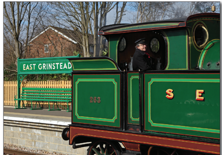
H class locomotive number 263 provides proof that steam has made it to East Grinstead.