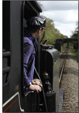
A driver's eye view!