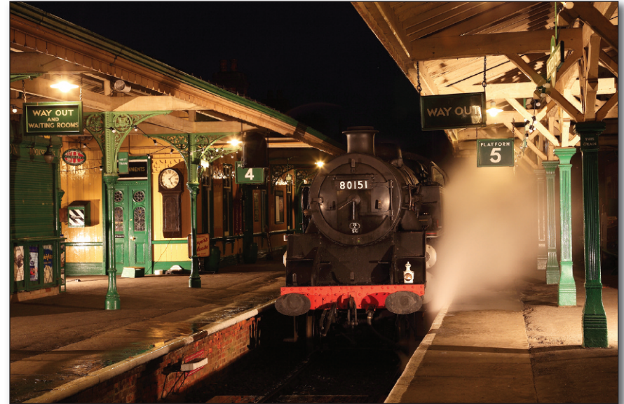
Sitting between platforms 4 and 5, 80151 awaits its next duty.